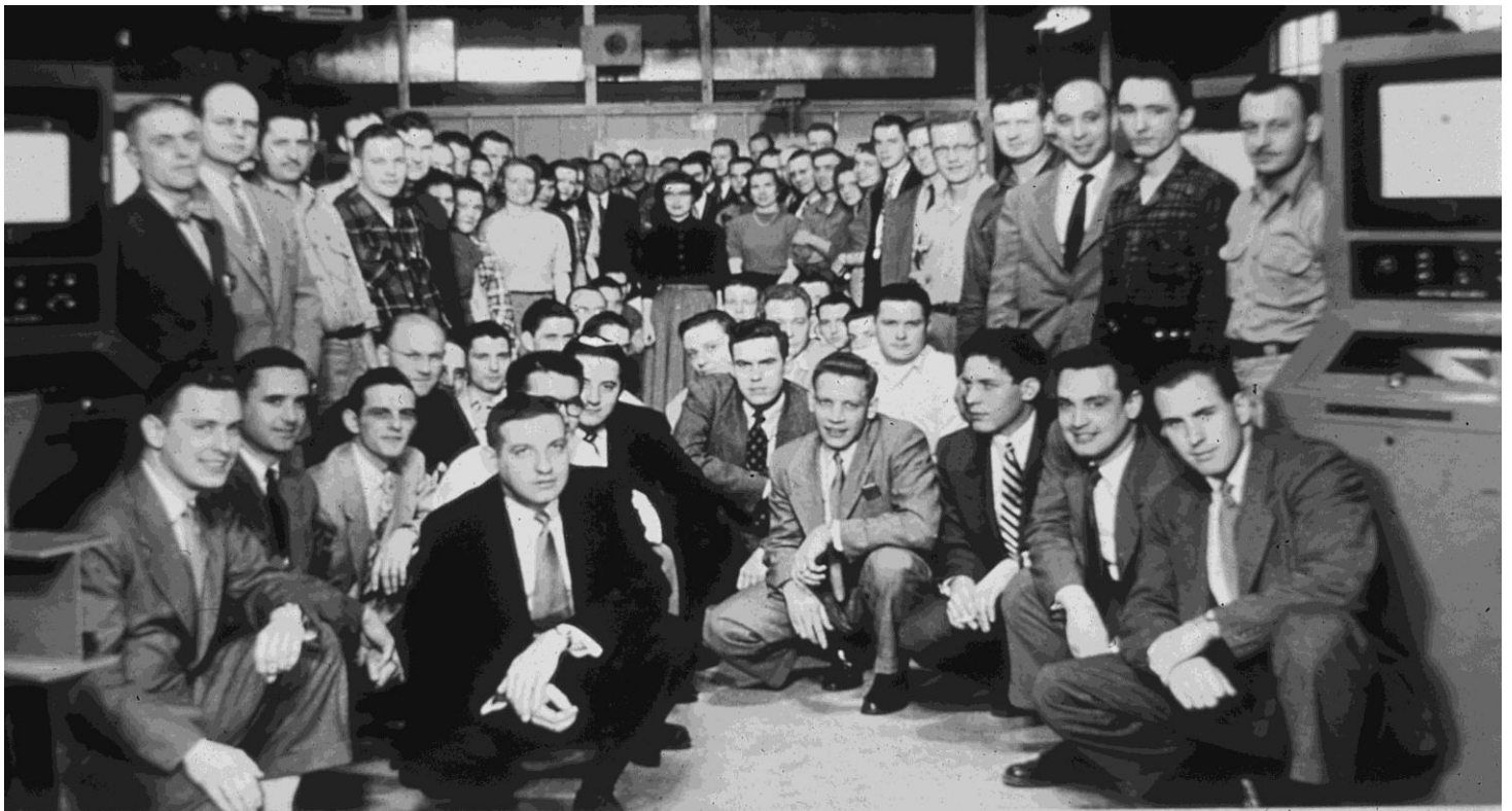
I.N. TEAM - 1952