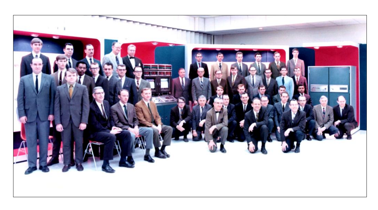
AccuRay 600 and 700 Development Team