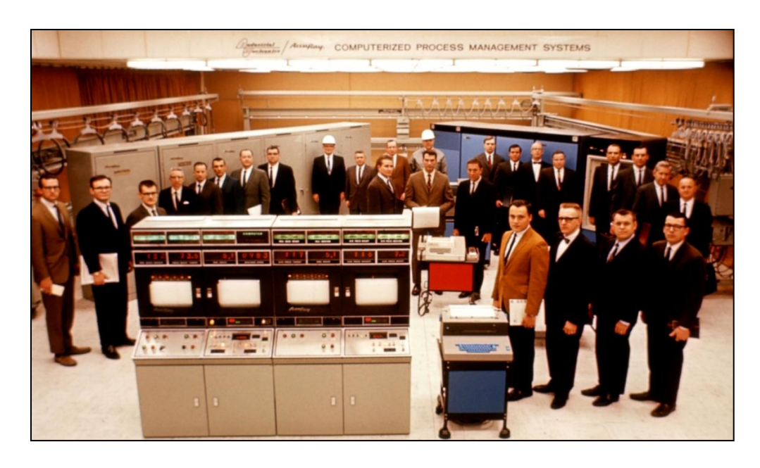
AccuRay APM (AccuRay Process Management) 800 Development Team