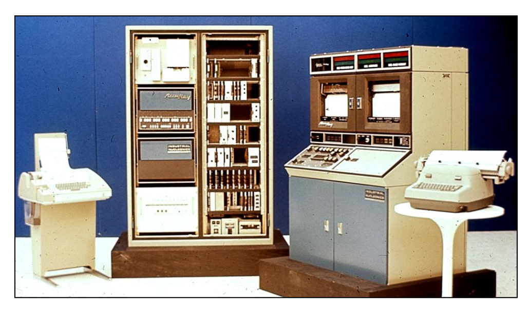
AccuRay APM (AccuRay Process Management) 800 System with mini-computer