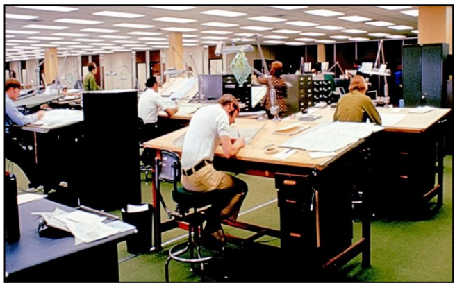
NPD Electronics Lab