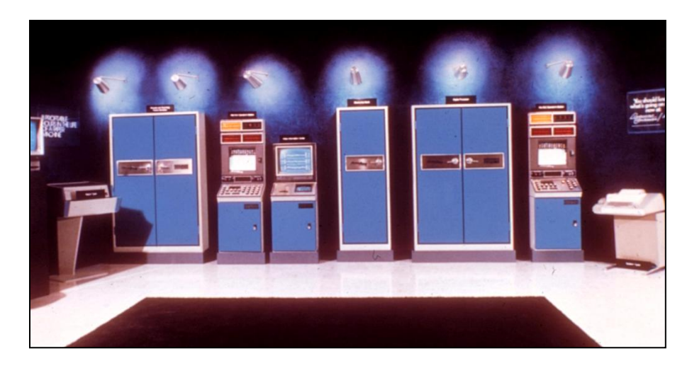
AccuRay APM (AccuRay Process Management) 800 System