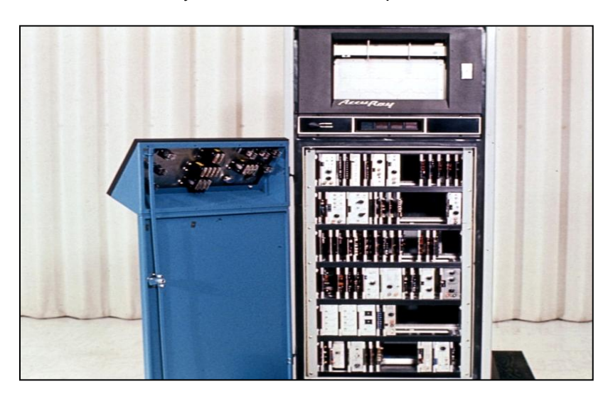
AccuRay 600 system (Operator console with transistors and integrated circuits)